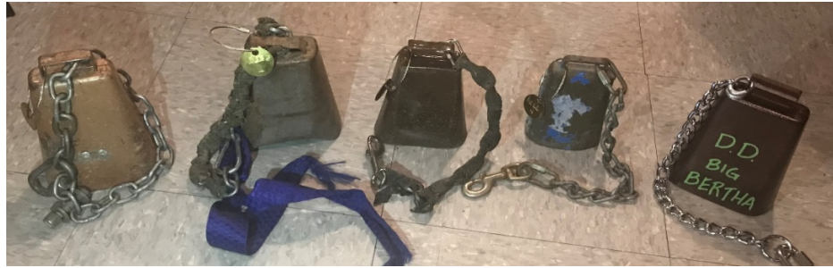
From left to right cowbell 1, 2, 3, 4 and 5