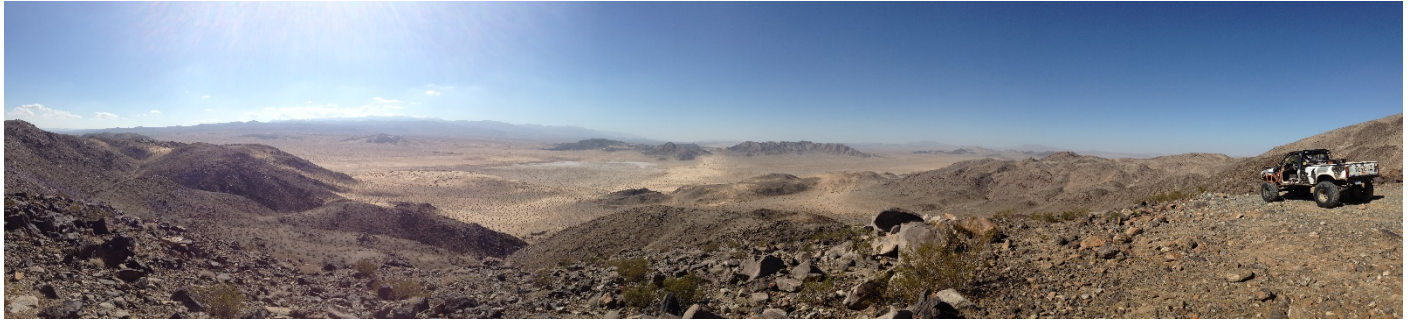
A view of Means wet lake, yep over an 18 hour period it rained 4inches or more.